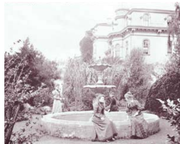
Tarnished treasures: The Carnegie fountain in its glory days. Future plans may include restoration of previously existing features, such as this ibis-adorned fountain or the carriage drive from Wetmore Gate to the Oval.

The project team focused on the future of two major campus locations: the Oval and the area surrounding the intersection of Richards and Kapiolani roads. The design of the building now under construction at that intersection (see page 14) was informed by the results of the Getty research.