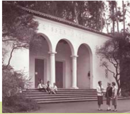
Extreme makeover: In 1910, Lisser Hall's south-facing façade was graced with classic Greek columns; in 1927, the building's new arched front porch opened to the north.

in terms of its history, of who walked here, of who envisioned this place," she says. "The people came alive for me, each one of them."