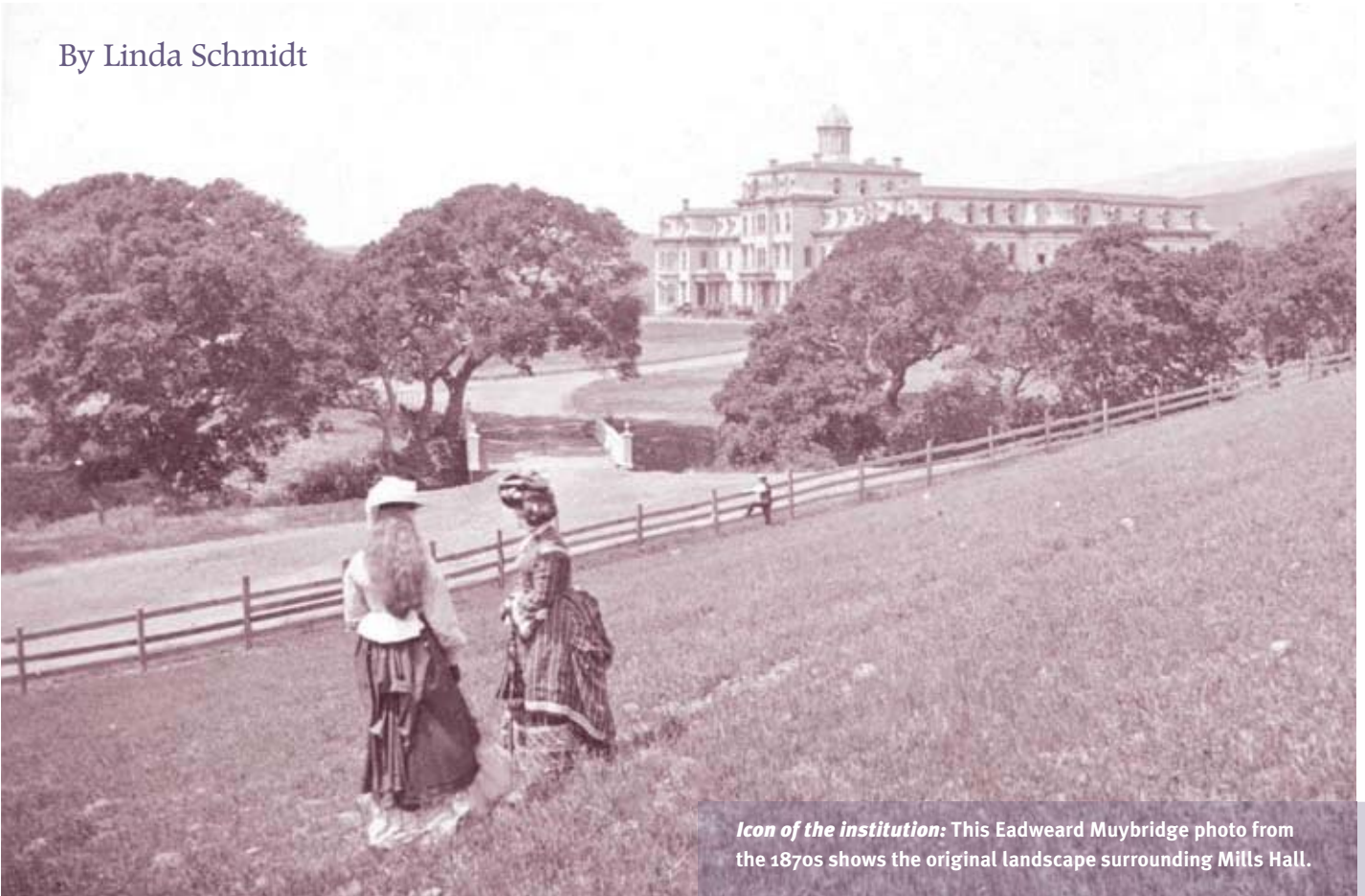
Icon of the institution: This Eadweard Muybridge photo from the 1870s shows the original landscape surrounding Mills Hall.

The only constant is change, posits one old adage. This has certainly held true of Mills' Oakland campus, even from its earliest days. When Cyrus and Susan Mills moved their women's college here from its original location in Benicia in 1871, they were surrounded by a wide-open swath of pasture land transected by two small creeks. Over the following decades, they added a handful of buildings and planted well over 50,000 trees and shrubs to transform the parcel into a forested haven for the young women of the time.