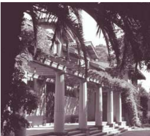
Gone but not forgotten: Julia Morgan designed the gymnasium above, along with Alumnae Hall and Hellman Pool, to form a U-shaped complex on the edge of Toyon Meadow. Only Alumnae Hall, now known as the Student Union, still stands.